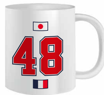
TOKYO ref: 243-9010010-03 Pris: 148,-