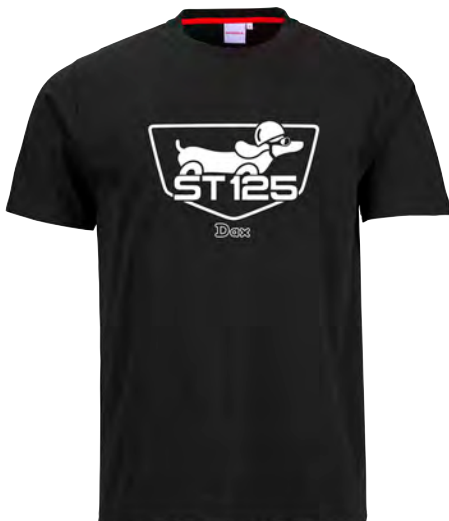
DAX ref: 233-8820042 Pris: 268,-