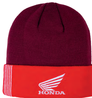
RED RACING ref: 243-0506042-01 Pris: 198,-