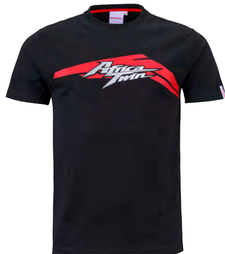
AFRICA TWIN BLACK ref: 233-8820040-09 Pris: 268,-