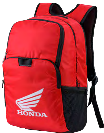
RACING ref: 233-6117021-01 Pris: 578,-