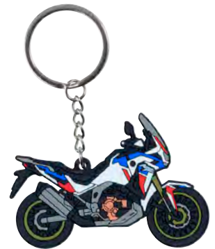
7cm AFRICA TWIN RUBBER ref: 233-0601015 Pris: 48,-