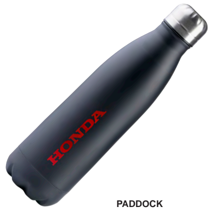
PADDOCK ref: 233-9010020-09 Pris: 248,-