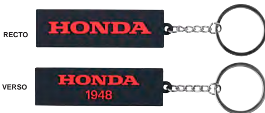
PADDOCK RUBBER ref: 233-0601012-09 Pris: 48,-