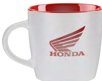
RACING ref: 243-9010010-01 Pris: 148,-