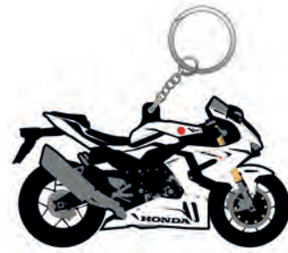
7cm CBR RUBBER ref: 233-0601014 Pris: 48,-