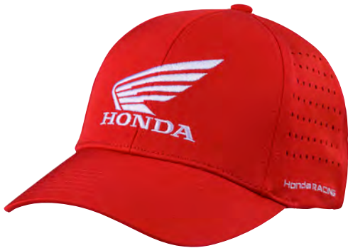
FACTORY ref: 233-7020060-21 Pris: 198,-