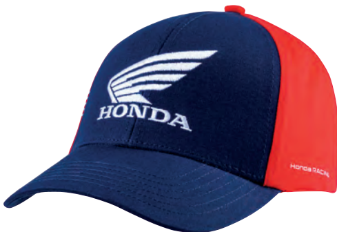
RACING NAVY ref: 243-7020060-02 Pris: 198,-