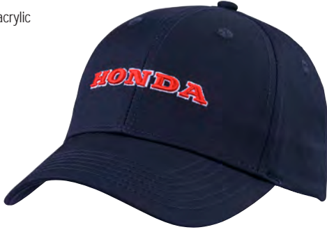
TOKYO DENIM ref: 233-7020060-02 Pris: 198,-