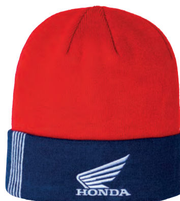
NAVY RED RACING ref: 243-0506042-20 Pris: 198,-