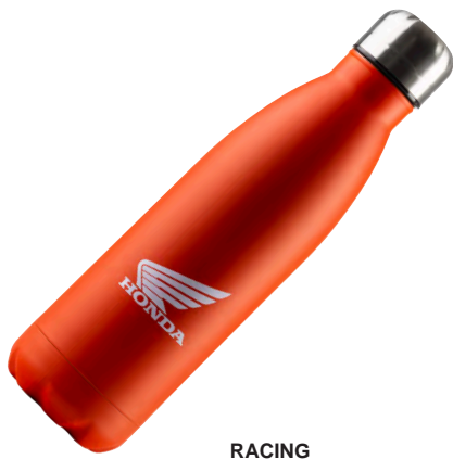
RACING ref: 223-9010020-01 Pris: 248,-