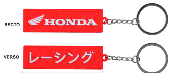
RACING RUBBER ref: 233-0601012-01 Pris: 48,-