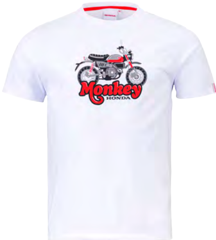
MONKEY ref: 233-8820040-33 Pris: 268,-