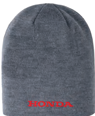
CORPO REVERSIBLE 243-0506042-03 Pris: 198,-