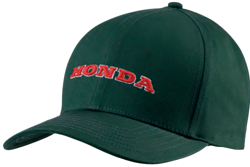
TOKYO GREEN ref: 243-7020060-05 Pris: 198,-