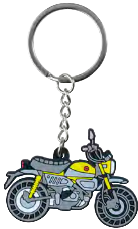
5cm MONKEY RUBBER ref: 233-0601016 Pris: 48,-