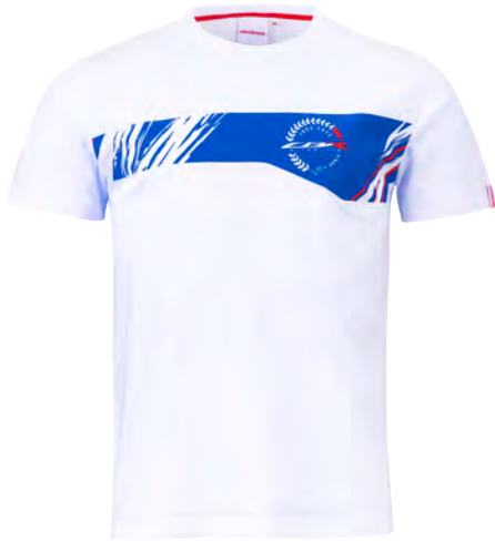
CBR 30 TH ref: 233-8820040-30 Pris: 268,-