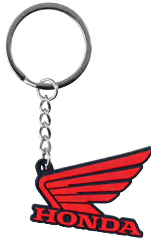
4cm WING RUBBER ref: 233-0601013 Pris: 48,-