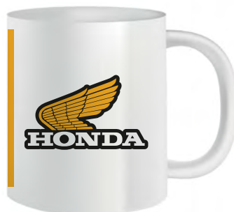
VINTAGE ref: 243-9010010-00 Pris: 148,-