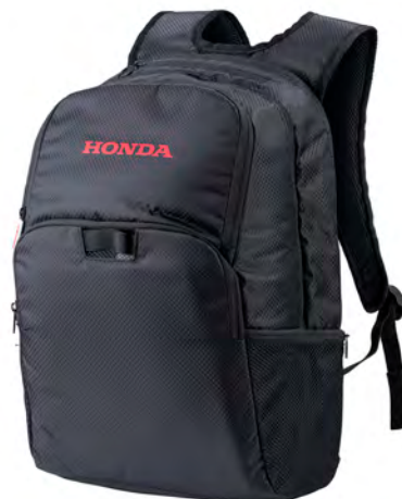
PADDOCK ref: 233-6117021-02 Pris: 578,-