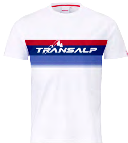
TRANSALP ref: 233-8820046 Pris: 248,-