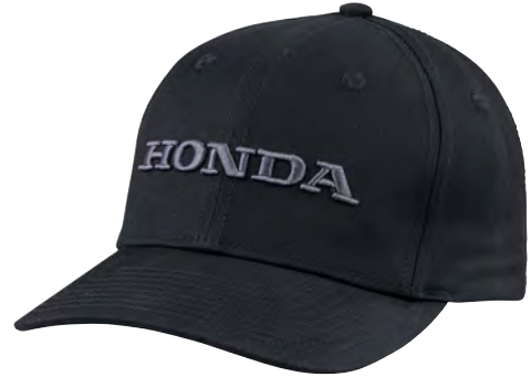
PADDOCK ref: 233-7020060-09 Pris: 198,-