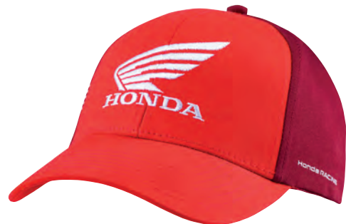
RACING RED ref: 243-7020060-01 Pris: 198,-