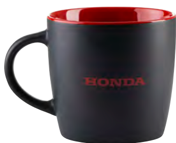
Paddock ref: 223-9010010-02 Pris: 98,-