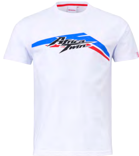
AFRICA TWIN WHITE ref: 233-8820040-00 Pris: 268,-