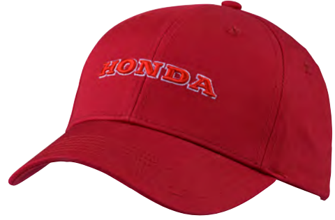
TOKYO RED ref: 233-7020060-01 Pris: 198,-