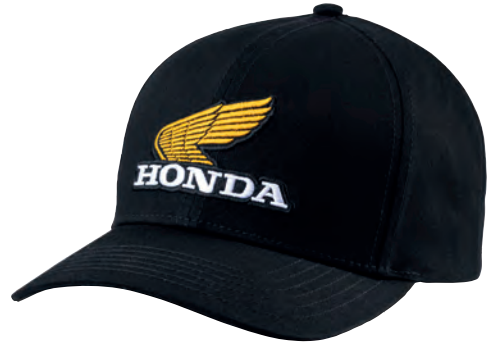
VINTAGE BLACK ref: 243-7020060-11 Pris: 198,-