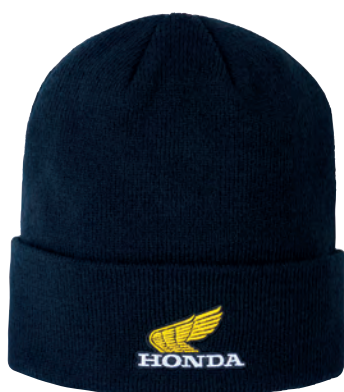
VINTAGE ref: 243-0506042-09 Pris: 198,-